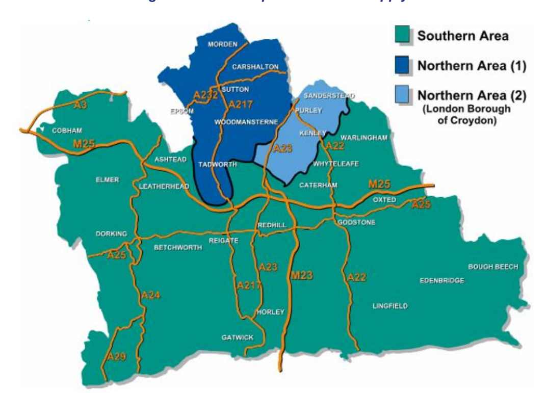
Figure 3.1: Area Map of SES Water Supply Area

NAV bulk supply charges are based on the applicable charges for wholesale services. These charges for wholesale services vary by charging area within SES. The company has three charging areas – Southern, Northern (1) and Northern (2). These charging areas can be seen on the area map below. For the purposes of calculating NAV bulk supply charges the two Northern charging areas can be regarded as one, as the measured charges are the same for each Northern area.