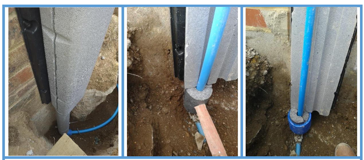
Shalloduct is used on any pipework that has not been insulated with the insuduct unit down to the 750mm depth, with ducting around the insulation.