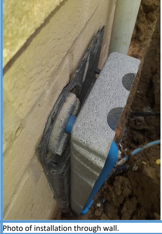
Boxing and insulation fitted and sealed.