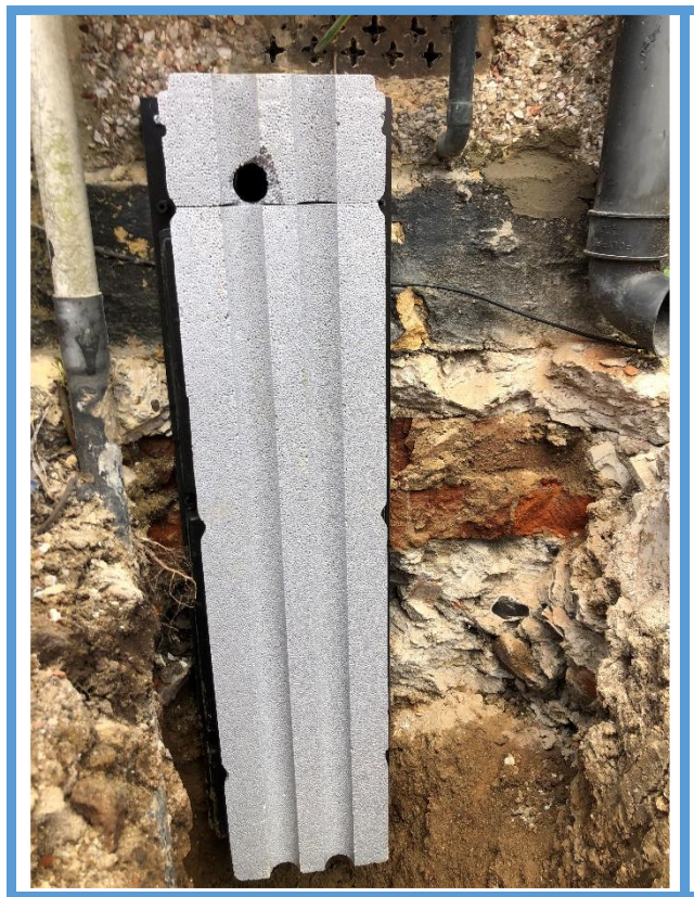
Back plate and insulation fitted