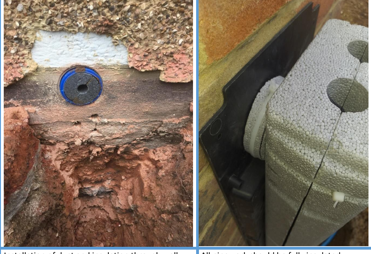
Installation of duct and insulation through wall.